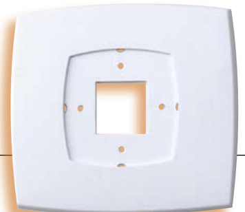
6.3" w x 5.8" h x .2" d

A slim attractive wall plate for the T1010 and T1050 makes replacing old thermostats with new Venstar thermostats easy. This accessory can quickly cover existing wall blemishes and old paint marks to make installations effortless.