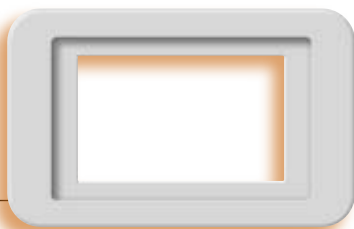
7.3" w x 5" h x .9" d

A slim attractive wall plate for the T0130, T1035, T0140 and T1045 makes replacing old thermostats with new Venstar thermostats easy. This accessory can quickly cover existing wall blemishes and old paint marks to make installations effortless.