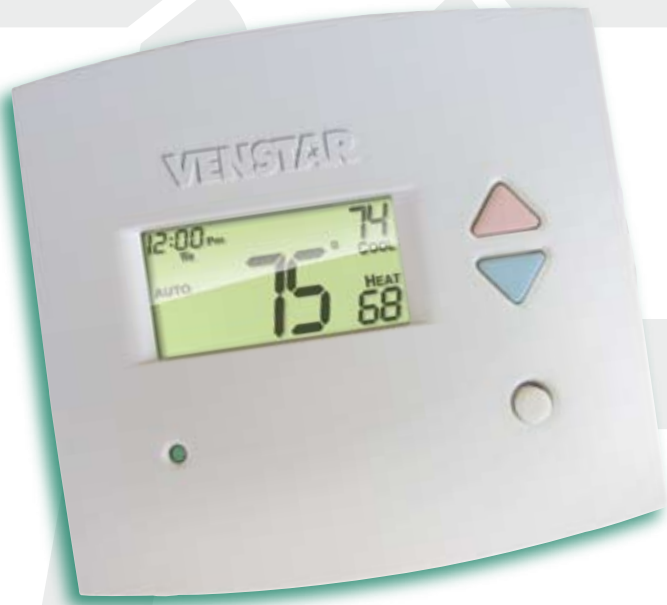
4.8" w x 4.3" h x 1.1" d